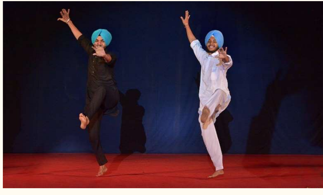
Intra fresher Dance competition displaying cultural diversity.

Intra Fresher Competitions: Care must be taken to have as relaxed a schedule as possible so that any student can freely participate in as many events as possible without having to pick and choose between different interests. One suggestion would be to introduce a points system and have a competition among different branches on the basis of that. The ones who end up on the podium in a particular event will contribute a certain number of points to their branch and will get some personal rewards as well. Broadly speaking, there could be three categories of competitions held: Cultural, Technical and Sports. For example under Cultural, activities like Debate, Dance, Singing, etc. can be conducted.