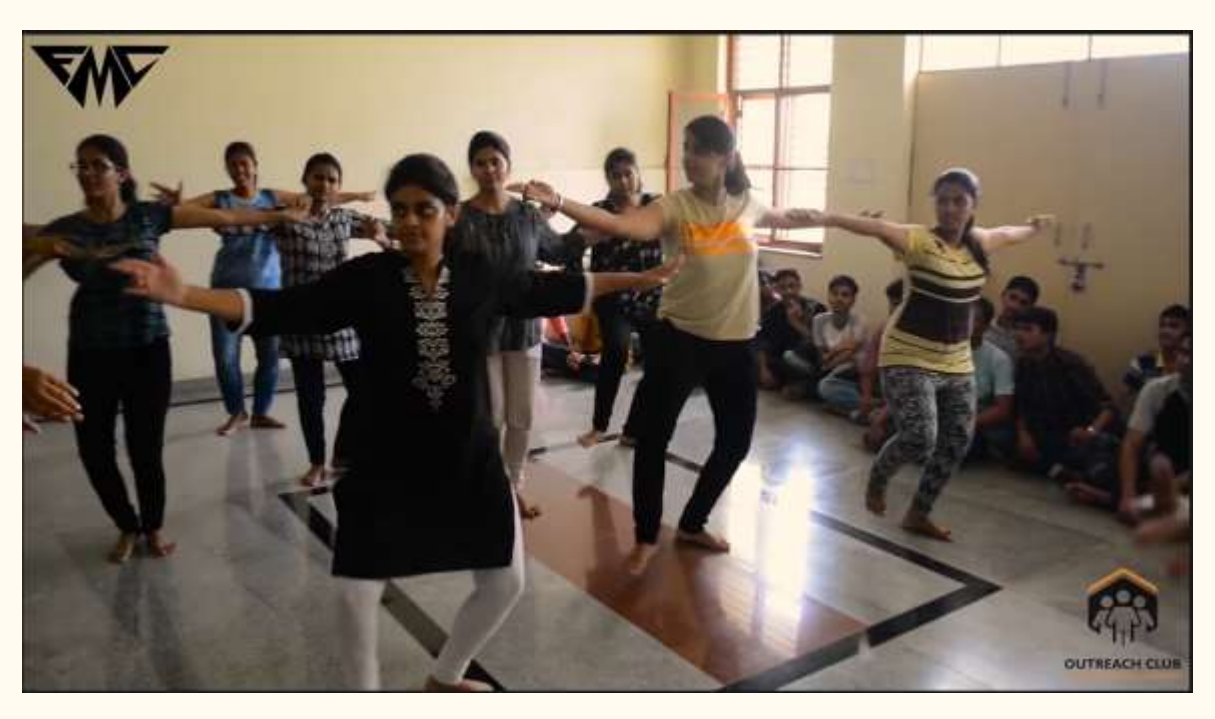
Students practicing classical dance during their Creative Practices class during the induction program.