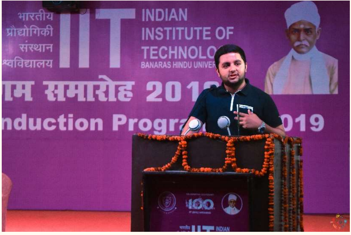
Guest talks on entrepreneurial and academic aspects during Induction Program.