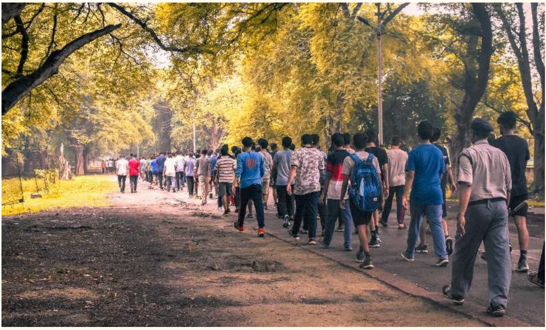
Morning campus walks and jogging during Induction Program.