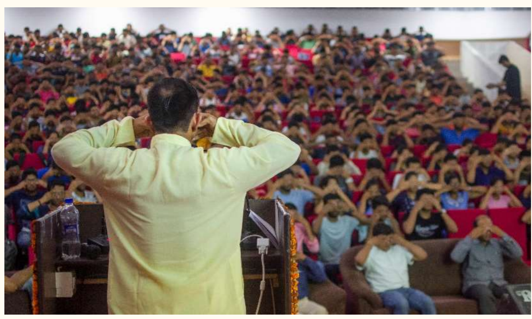
Speaker interacting with audience through meditation.