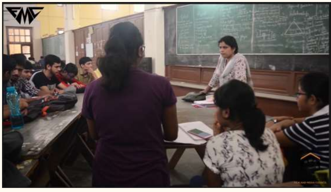
Discussion and interaction in Universal Human Value classes between students and faculty members.