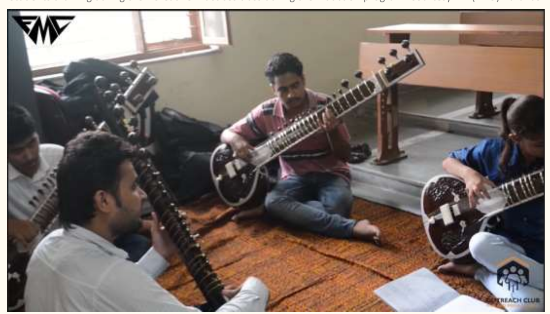
Students playing sitar during their Creative Practices class during the induction program.