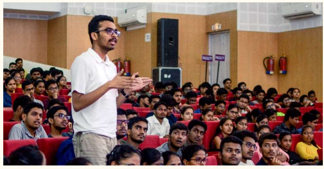
Student interacting with the speaker during the Guest talk.

Guest lectures are a great way to help the students gain a perspective on many different things in the world. Eminent personalities in different fields of expertise like academics, sports, industry, business etc. can share their story and talk about important subjects like career, entrepreneurship, government policies, technology etc. Their stories will act as inspiration for the students embarking on a new phase in life. From these lectures, students will also be able to make note of valuable advice from the experienced persons and apply it in their life. They can know more about many fields and learn more about what interests them on an individual level and make progress in that field. Ensure that the invited guest speakers belong to a diverse set of fields for more diversity in thoughts and experiences.