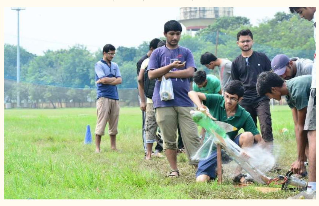
Intra fresher water rocket competition, by aero modelling club.