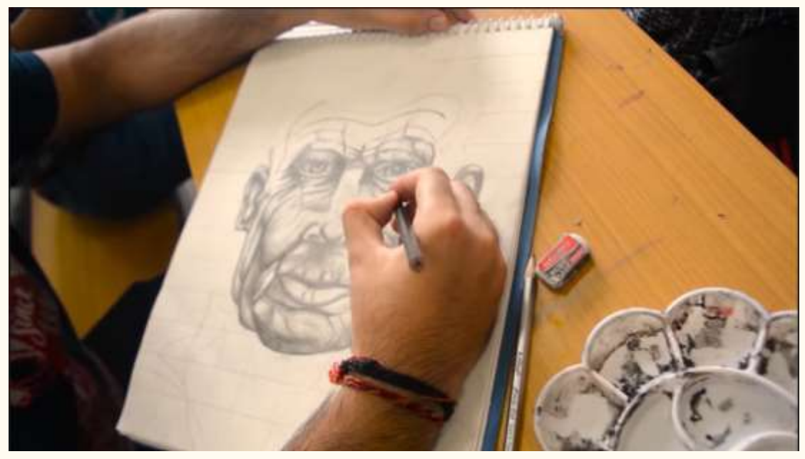
Students drawing during their Creative Practices class during the induction program.