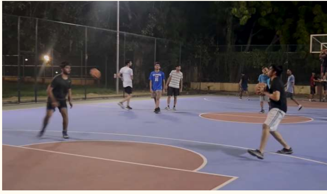
Evening sports activities and games during Induction Program.