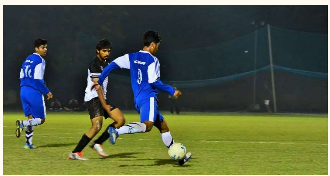
Intra fresher Sports competition.