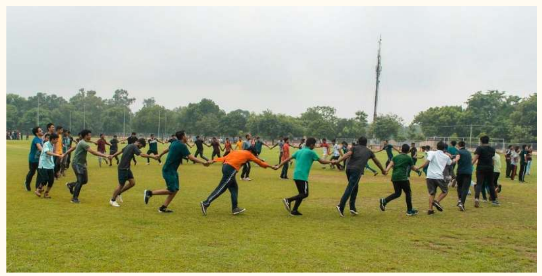
Morning sports and Yoga activities during Induction Program.