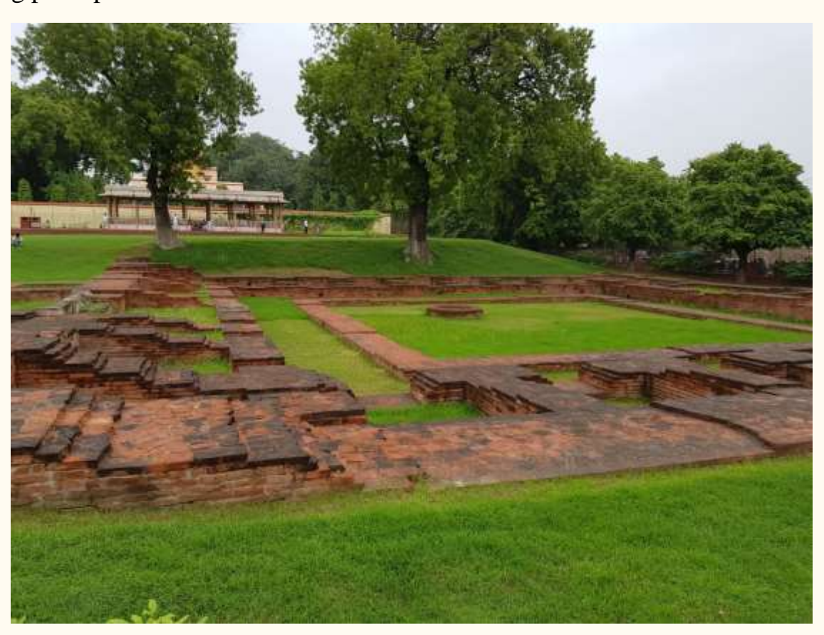
Visit to Sarnath, near Varanasi and introducing the culture through the visit during Induction Program.

For a student to relate to the social environment of the educational institution as well as the surroundings, a place wherein their most significant years students will scribble some indelible memories, an absolute necessity is generated for city visits to let students understand the environment through interaction with the people, place, history, and politics. This activity may also help the students to understand the local problems further, which will help to increase the innovative thinking for the solution to those problems. Under 'City Visits' villages (to understand how the natives manage their lives: production, lifestyle, housing, relations, education, transfer of skills), monuments of the city and near-by historic places (to let the students blend themselves in the cultural ethnicity and learn about it), old-age-homes/orphanages (to evoke a sense a responsibility towards the society and a feeling of gratitude towards their privileges), renowned people who have contributed significantly towards the society can be visited along with a guide/mentor, so that the knowledge of students gets enhanced. Alongside this, they can, in an informal discussion, present their ideas as to how they may contribute towards society. Organizations serving civilization or doing some charitable work may also be visited or collaborated with to get students to understand their working principles and serve mankind.