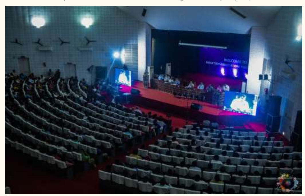
Address by authorities at Orientation-Induction Program.