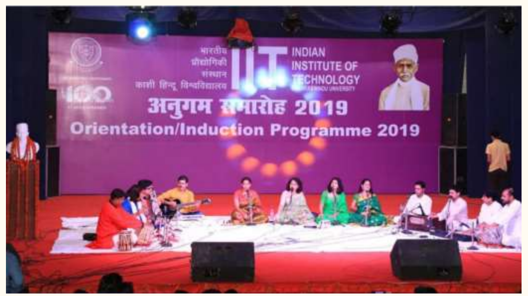
Music performance at Orientation-Induction Program.