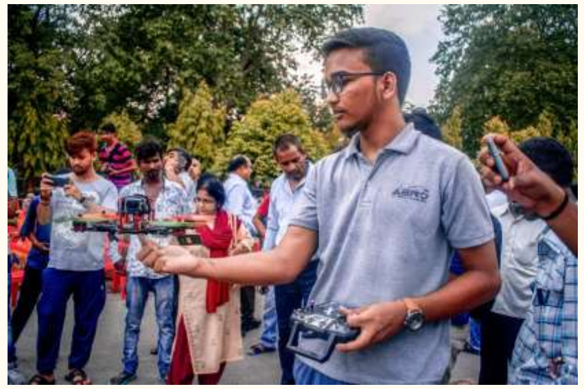
Display of work done by club members of Aero modelling club during orientation.

Club/Council/Committee Briefings: Clubs/Council/Committee are a vital part of a college's ecosystem and it is thus imperative that students are well briefed regarding them. The details of the briefing will vary from college to college, but the brief outline has been described here, along with the reasons that make such a briefing essential. It would be advisable to have the Secretaries/Presidents and other position holders draft a welcome address for the new entrants. This should serve as an advertisement for the club's activities, scope and culture. A member of the Debate Club, for example, should go through an analysis of why learning how to debate is a useful/interesting skill and how the club members would help the new entrant learn and develop these skills. Similarly, a member of the Design Club could have the club members showcase their skills through a quick extempore portrait creation. This would be quite engaging and entertaining for the spectators. If there are any committees which are not student-run, the people in charge could take it upon themselves to organize this presentation for the students. The main objective would be to ultimately ensure that every student goes into the academic year with a very strong basic idea of what to expect from a club and whom he or she could contact in order to have a better idea of what to do.