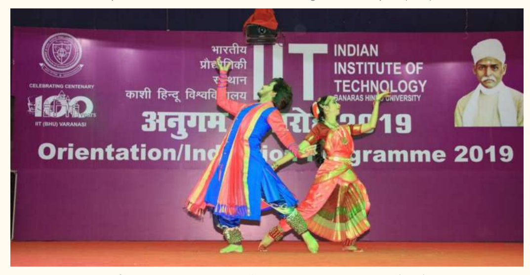
Dance performance at Orientation-Induction Program.