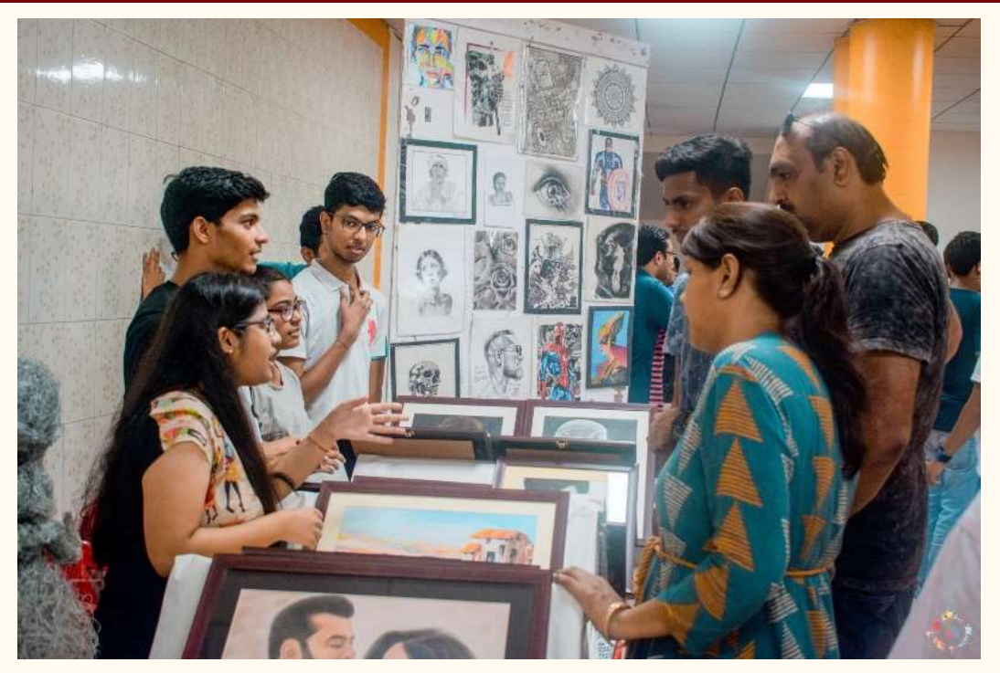
Display of work done by Fine Arts club during orientation.

Intra Fresher Competitions: Care must be taken to have as relaxed a schedule as possible so that any student can freely participate in as many events as possible without having to pick and choose between different interests. One suggestion would be to introduce a points system and have a competition among different branches on the basis of that. The ones who end up on the podium in a particular event will contribute a certain number of points to their branch and will get some personal rewards as well. Broadly speaking, there could be three categories of competitions held: Cultural, Technical and Sports. For example under Cultural, activities like Debate, Dance, Singing, etc. can be conducted.